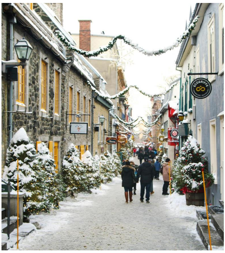
9 Days • 9 Meals: 6 Breakfasts, 3 Dinners

HIGHLIGHTS... Quebec City's German Christmas Markets, Montreal's Christmas Markets, Montmorency Falls, Maple Sugar Shack, Bûche de Noël Workshop