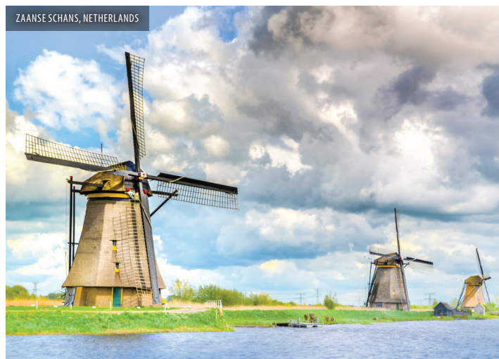
ZAANSE SCHANS, NETHERLANDS