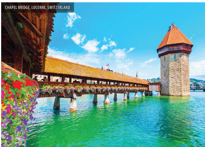
CHAPEL BRIDGE, LUCERNE, SWITZERLAND

Day 13: Fri, Oct 17 — LAKE COMO — LUCERNE, SWITZERLAND. Travel to Lucerne.