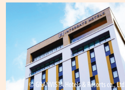
HOTEL INTERGATE HIROSHIMA – 3-star (5 Nights)

Ideally located near a train station and just three minute walk from a tram stop, the hotel is also situated a short distance from the Hiroshima National Peace Memorial Hall and Children's Peace Museum.