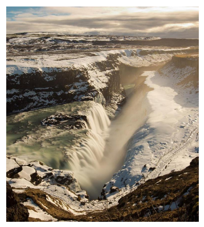
11 Days ● 12 Meals : 7 Breakfasts, 5 Dinners

HIGHLIGHTS... Reykjavík, Northern Lights Cruise, Search for the Northern Lights, Golden Circle, Thingvellir National Park, Gullfoss, Lava Exhibition Center, Vik, Seljalandsfoss, Skógar Museum, Skógafoss, Sólheimajökull Glacier, Jökulsárlón Glacial Lagoon, Blue Lagoon