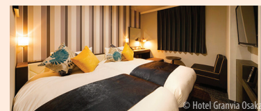
HOTEL GRANVIA OSAKA – 4-STAR (2 NIGHTS): Located in the center of the spirited and historic city of Osaka, the hotel is directly connected to the JR Osaka train lines.