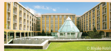
MIYAKO HOTEL KYOTO HACHIOJO – 4-STAR (3 NIGHTS): One of the largest hotels in Kansai, with an excellent location in front of the Shinkansen, JR, and Kintetsu Kyoto Stations.

Day 5: Sat, Dec 13 – KYOTO – OSAKA. After breakfast, enjoy a full day of SHOPPING! This morning view the stunning vermilion colored Fushimi Inari Shrine , whose four kilometer long tunnel of scarlet torii gates was featured on the film Memoirs of a Geisha . Enjoy some time shopping around Gion Street , Kyoto's most famous geisha district, located around Shijo Avenue between Yasaka Shrine in the east and the Kamo River in the west. It is filled with shops, restaurants and ochaya (teahouses), where geiko (Kyoto dialect for geisha) and maiko (geiko apprentices) entertain. Next visit Nishiki Market , also known as "Kyoto's Kitchen," is a narrow, five block long shopping street lined by more than one hundred shops and restaurants. Specializes in all things food related, like fresh seafood, produce, knives and cookware, and is a great place to find seasonal foods and Kyoto specialties, such as Japanese sweets, pickles, dried seafood and sushi. Finally, explore one of the most popular shopping streets in all of Kyoto, Teramachi Shopping Arcade , located right in the middle of downtown Kyoto. Teramachi Shopping Arcade is a fascinating blend of history and modernity – from long established stores selling kimonos and traditional crafts to stores offering