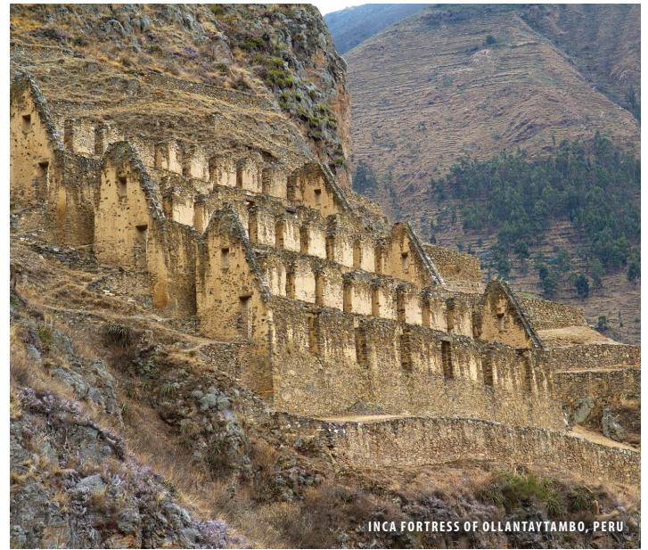
INCA FORTRESS OF OLLANTAYTAMBO, PERU

Day 6: Sat, Nov 22 — HACIENDA CONCEPCIÓN. A short boat ride brings you to a native farm where farmers use ancient methods to grow crops. Learn about local cultivation