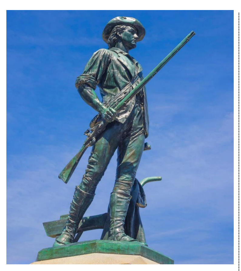
10 Days ● 12 Meals: 8 Breakfasts, 1 Lunch, 3 Dinners

HIGHLIGHTS... Museum of the American Revolution, West Point Academy, NYC Panoramic Tour, Arlington National Cemetery, U.S. Capitol Building Tour, Lexington & Concord, Liberty Bell