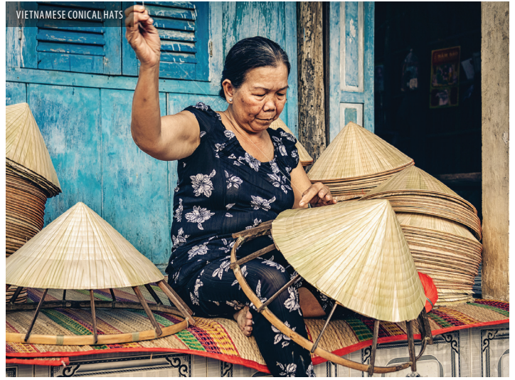
VIETNAMESE CONICAL HATS

Day 15: Thur, Feb 12 — PHNOM PENH — DISEMBARK AVALON SAIGON — SIEM REAP. Disembark the Avalon Saigon. Fly to Siem Reap , home to the Temples of Angkor, considered by many to be the most spectacular architectural ruins on Earth!