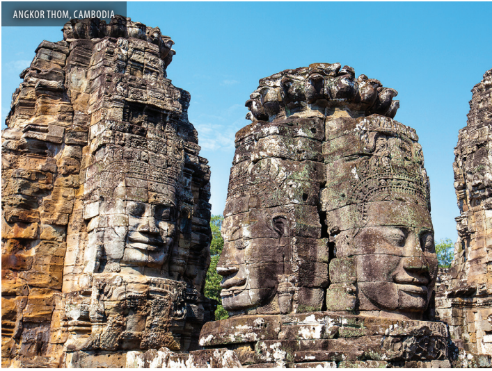
ANGKOR THOM, CAMBODIA

see traditional floating homes, speedboat merchants, religious sites, a market selling dried goods, and more.