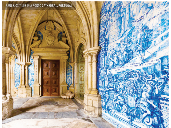
AZULEJOS TILES IN A PORTO CATHEDRAL, PORTUGAL

📷 CLASSIC EXCURSION: Join our Guide for a guided tour this morning to one of the most remote villages of the country, Freixo de Espada à Cinta village in the Douro International Nature Park, home to majestic birds of prey, OR