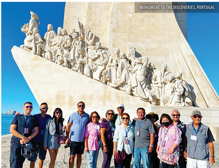
MONUMENT TO THE DISCOVERIES, PORTUGAL

are harvested and how the wines are made. At the end of your explorations, taste some of the wines, OR