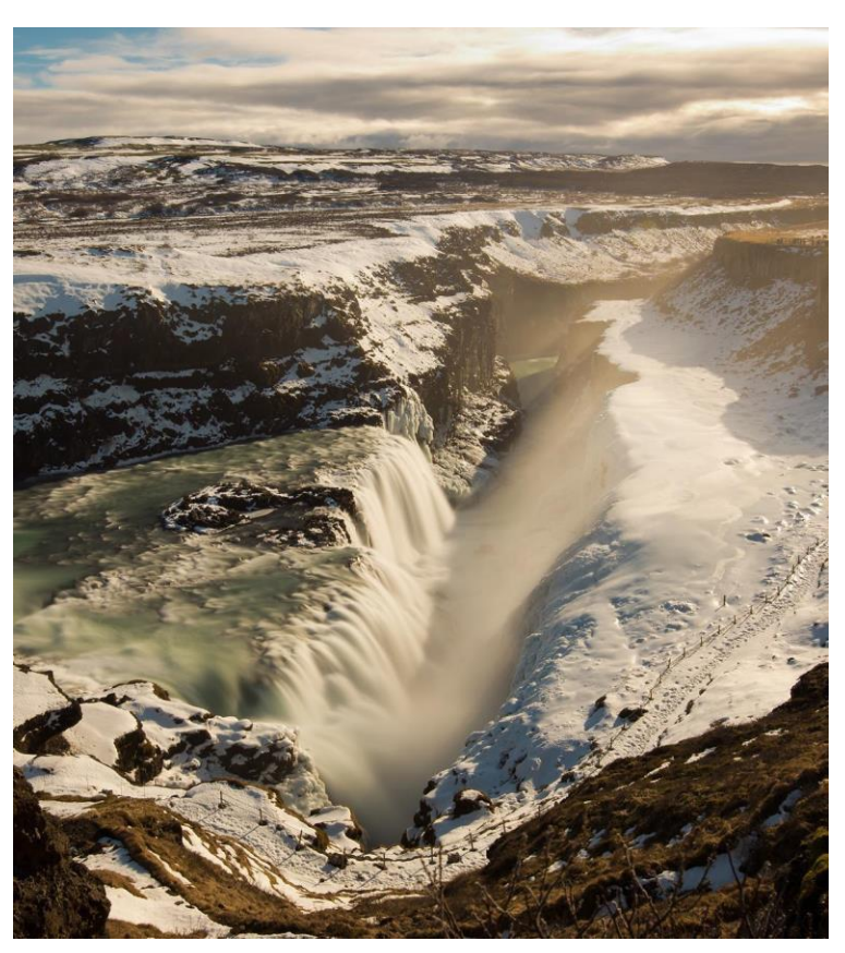
11 Days • 12 Meals: 7 Breakfasts, 5 Dinners

HIGHLIGHTS... Reykjavík, Northern Lights Cruise, Search for the Northern Lights, Golden Circle, Thingvellir National Park, Gullfoss, Lava Exhibition Center, Vik, Seljalandsfoss, Skógar Museum, Skógafoss, Sólheimajökull Glacier, Jökulsárlón Glacial Lagoon, Blue Lagoon