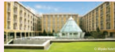
MIYAKO HOTEL KYOTO HACHIO – 4-STARS (3 NIGHTS): One of the largest hotels in Kansai, with an excellent location in front of the Kintetsu Kyoto, JR, and Shinkansen Stations.