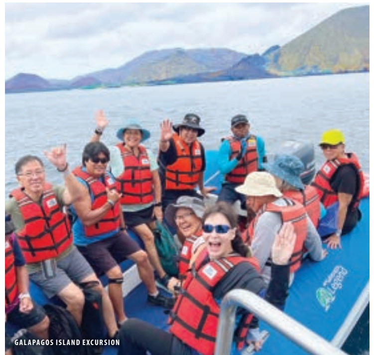
GALAPAGOS ISLAND EXCURSION