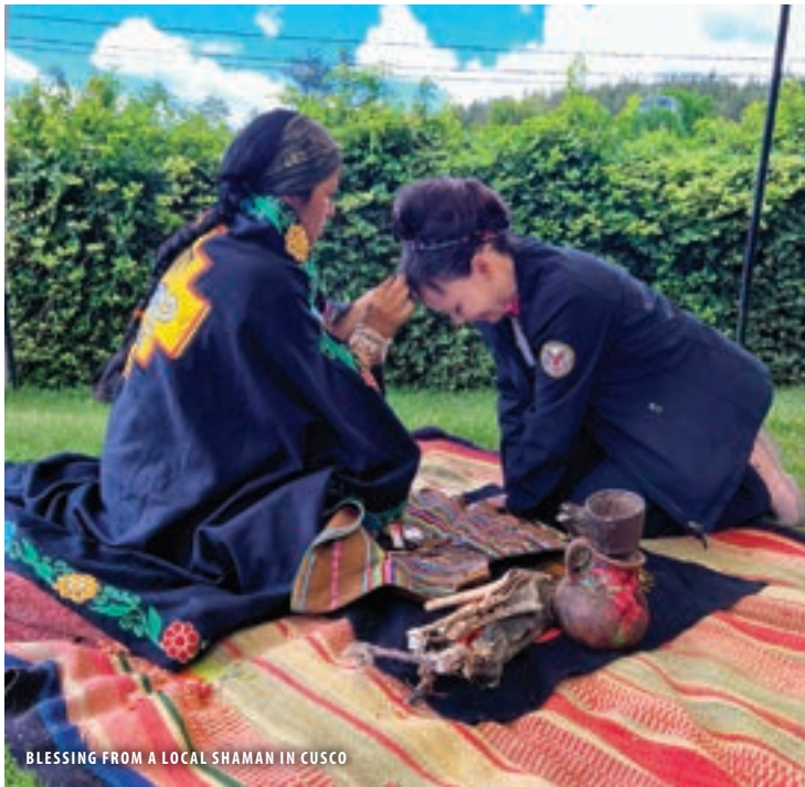
BLESSING FROM A LOCAL SHAMAN IN CUSCO

Epic wonders are closer than you think! Book early and SAVE!