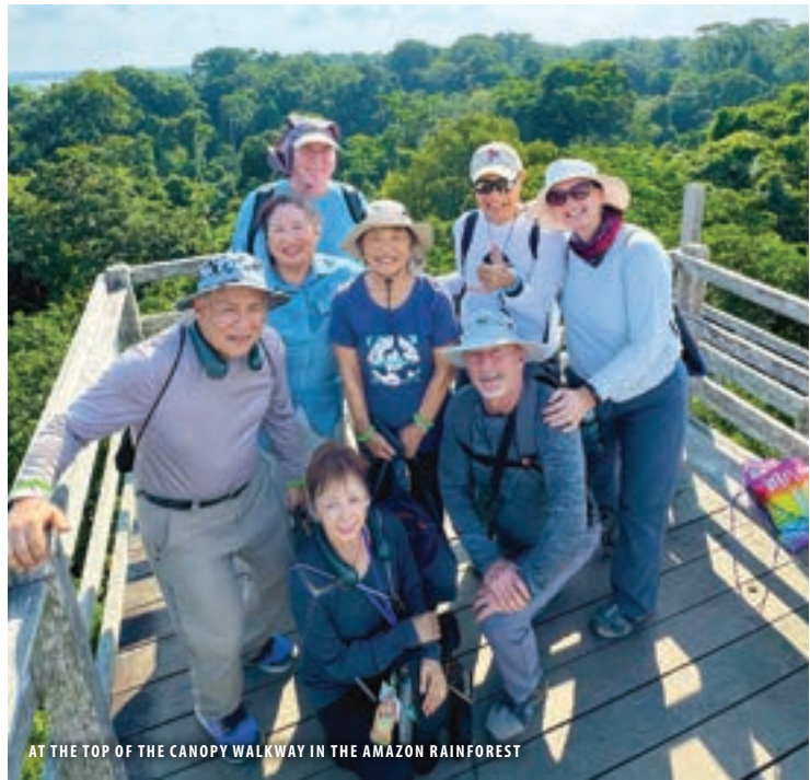
AT THE TOP OF THE CANOPY WALKWAY IN THE AMAZON RAINFOREST