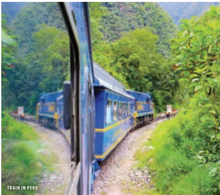
TRAIN IN PERU

experience their way of life in the Sacred Valley. Then, board the Vistadome Train for a scenic journey through the lush Urubamba Valley . Upon arrival, ascend the mountainside to legendary Machu Picchu , the “ Lost City of the Incas .” Your Local Guide will introduce this intact fortress with its temple remains, holy houses, and mile-long aqueduct, and will bring you closer to the mysteries still hidden in these amazing structures. Tonight you may wish to try a pisco sour, a traditional Peruvian cocktail, or an Inka Kola, before the included dinner. EL MAPI BY INKATERRA or Similar (1 Night) (B, D)