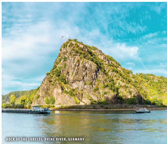
ROCK OF THE LORELEI, RHINE RIVER, GERMANY

DISCOVERY EXCURSION: Join a full-day Guided Tour to the magical Black Forest to experience the Vogtsbauernhof Open-Air Museum, visit an authentic water mill, and see a traditional butter-making demonstration, OR