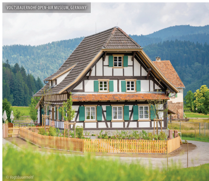
VOGTSBAUERNHOF OPEN-AIR MUSEUM, GERMANY

Select Sightseeing is included in tour. Additional Optional Tours are available for purchase through Globus and Avalon Waterways. Itinerary shown is based on Globus and Avalon's 2026 tour. Tour itinerary and inclusions are subject to change at any time with or without notice by Globus and Avalon. In the event of technical or water level issues, it may be necessary to operate the itinerary by motorcoach or alter the program, including hotel overnight when necessary. Guided Tours, Optional Excursions, activities, sailing and docking schedules may be contingent on weather conditions or other issues outside of Avalon's control and therefore be subject to change at any time.