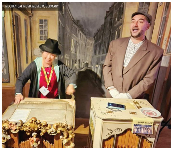
MECHANICAL MUSIC MUSEUM, GERMANY