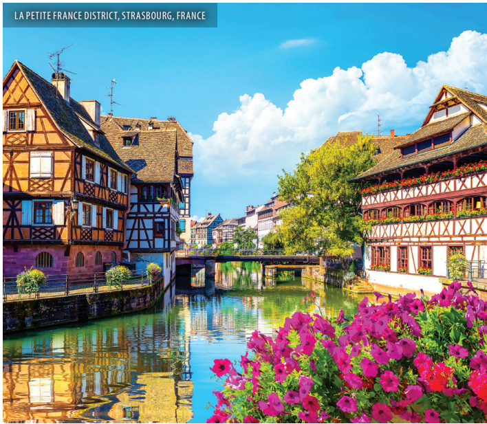
LA PETITE FRANCE DISTRICT, STRASBOURG, FRANCE

Day 13: Wed, July 08 — BREISACH — EXCURSION TO BLACK FOREST — CRUISE TO KEHL. Visit the Adventure Center for today's activities with your Adventure Host.