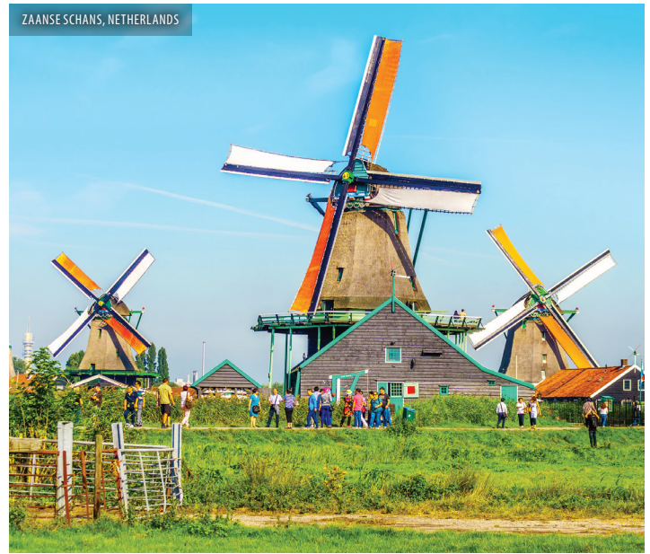
ZAAANSE SCHANS, NETHERLANDS

Museum for a one-of-a-kind instrumental experience; enjoy a tasting of the authentic Rüdesheimer coffee.