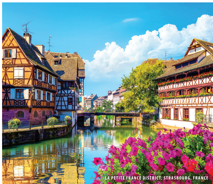
LA PETITE FRANCE DISTRICT, STRASBOURG, FRANCE

Day 13: Wed, July 08 — BREISACH — EXCURSION TO BLACK FOREST — CRUISE TO KEHL. Visit the Adventure Center for today's activities with your Adventure Host.