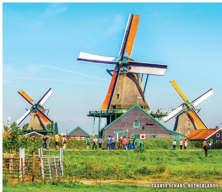
ZAANSE SCHANS, NETHERLANDS

DISCOVERY EXCURSION: Take a Guided Tour of the incredible Mechanical Music