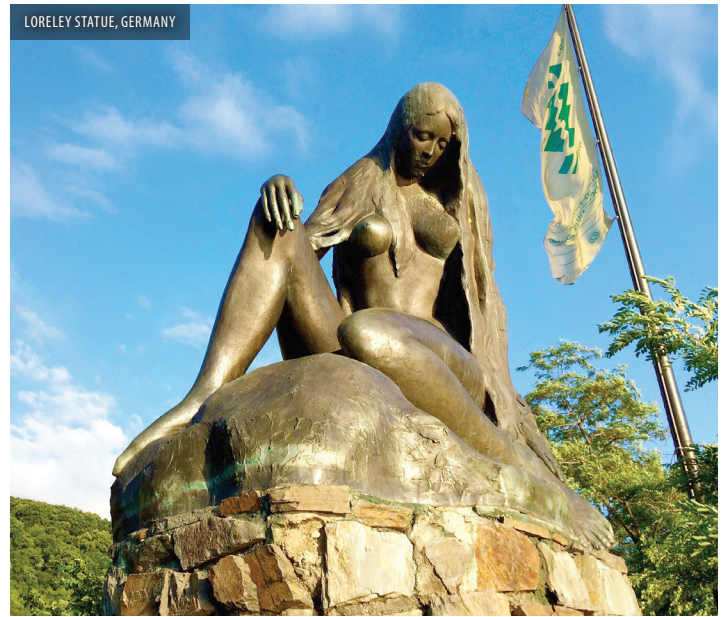
LORELEY STATUE, GERMANY

its rocky island on which it has endured on the water's edge for nearly four centuries. Enjoy a wine tasting of local wine before continuing by train to Zermatt. HOLIDAY HOTEL or Similar (2 Nights) (B, D)