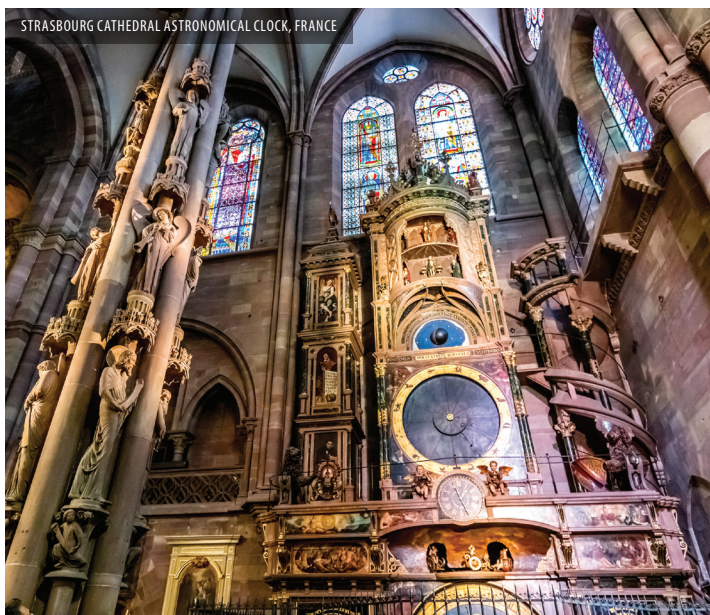
STRASBOURG CATHEDRAL ASTRONOMICAL CLOCK, FRANCE