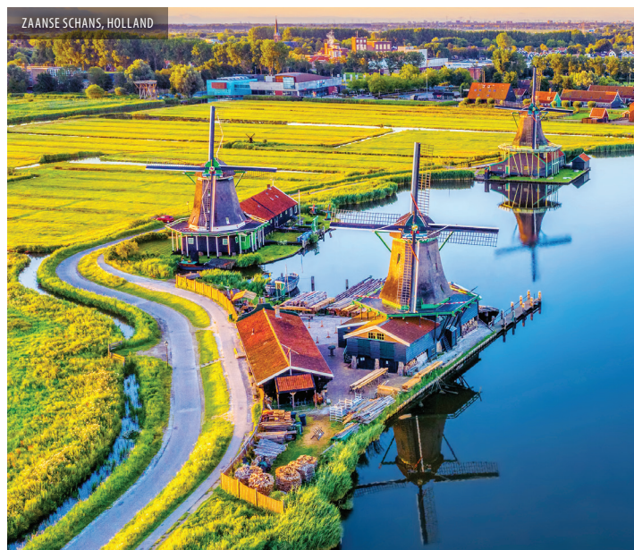
ZAANSE SCHANS, HOLLAND

🚶 ACTIVE EXCURSION: Enjoy the view on a relaxing bike ride along the Rhine with your Adventure Host, OR