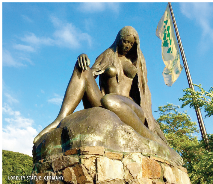
LORELEY STATUE, GERMANY

Day 6: Mon, Sept 07 — LAUSANNE — MONTREUX — TÄSCH — ZERMATT AREA. Discover the delightful Swiss mountain region of Zermatt. En route, stop to visit the town of Montreux, situated on the shores of Lake Geneva, surrounded by vineyards against the breathtaking backdrop of snow-covered Alps. Enjoy some free time or consider an Optional Guided Excursion to Chillon Castle, standing as solid as