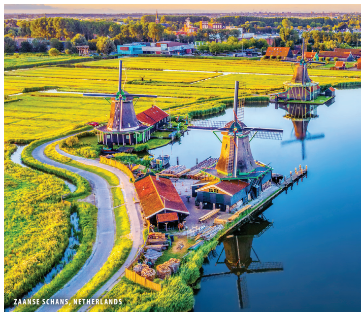
ZAANSE SCHANS, NETHERLANDS

DISCOVERY EXCURSION: Take a Guided Tour of the incredible Mechanical Music Museum for a one-of-a-kind instrumental experience; enjoy a tasting of the authentic Rüdesheimer coffee.