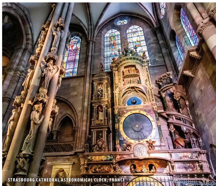
STRASBOURG CATHEDRAL ASTRONOMICAL CLOCK, FRANCE

ACTIVE EXCURSION: Enjoy the view on a relaxing bike ride along the Rhine with your Adventure Host, OR