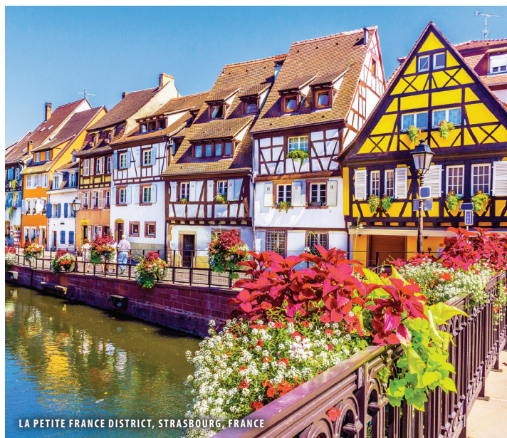
LA PETITE FRANCE DISTRICT, STRASBOURG, FRANCE

Day 13: Wed, Oct 07 — BREISACH — EXCURSION TO BLACK FOREST — CRUISE TO KEHL. Visit the Adventure Center for today's activities with your Adventure Host.