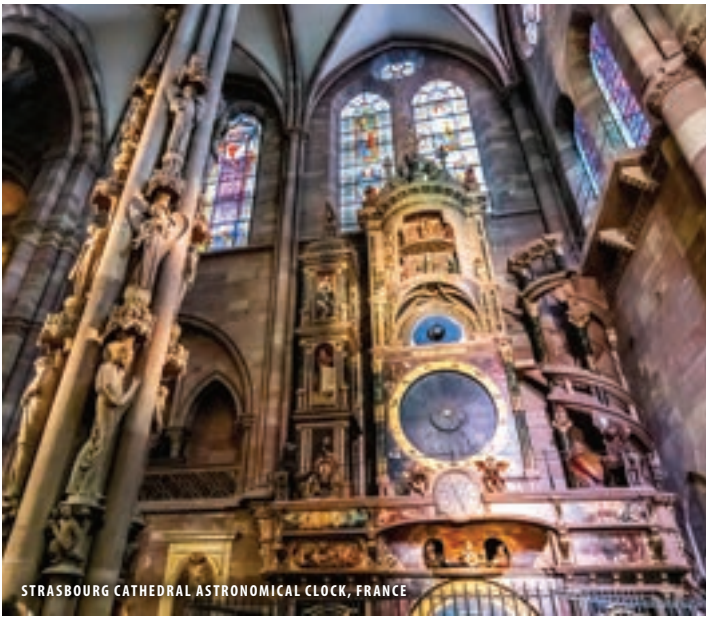
STRASBOURG CATHEDRAL ASTRONOMICAL CLOCK, FRANCE