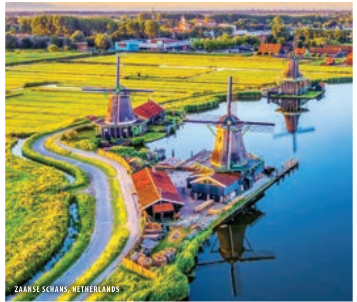
ZAANSE SCHANS, NETHERLANDS

🚶 ACTIVE EXCURSION: Enjoy the view on a relaxing bike ride along the Rhine with your Adventure Host, OR