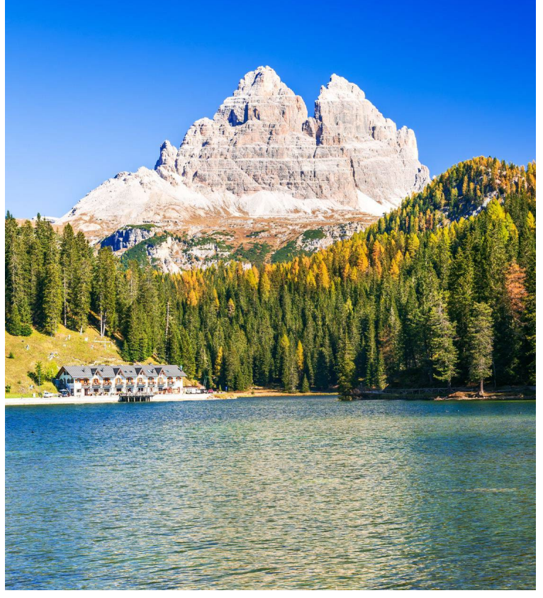
11 Days • 12 Meals: 8 Breakfasts, 1 Lunch, 3 Dinners

HIGHLIGHTS... Treviso, Tiramisu-Making Demonstration, Verona, Glassblowing Demonstration, Venice, Asolo, Prosecco Winery, The Dolomites, Bassano del Grappa, Venetian Villa Visit