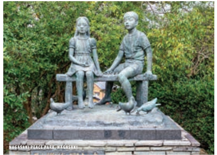
NAGASAKI PEACE PARK, NAGASAKI

Note: Tour itinerary is subject to change at any time with/without notice.