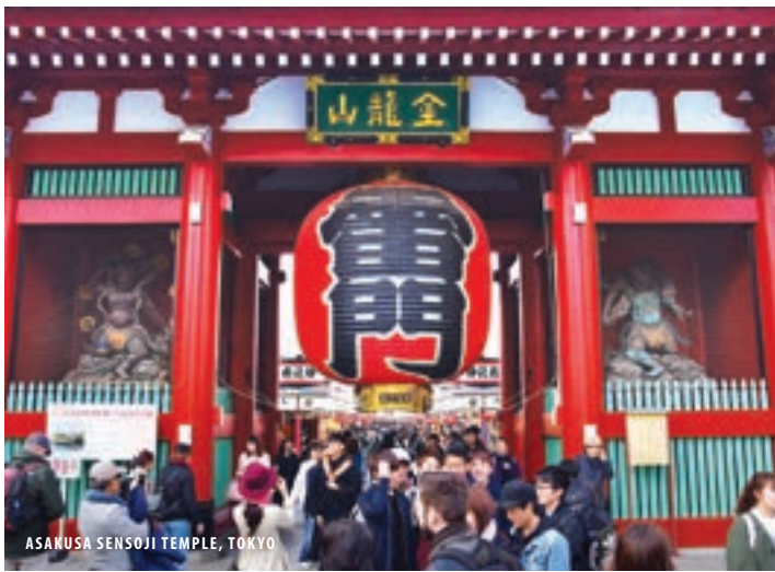
ASANUSA SENSOJI TEMPLE, TOKYO

Sightseeing in each port is NOT included. Shore excursions are available for purchase through Princess Cruises.