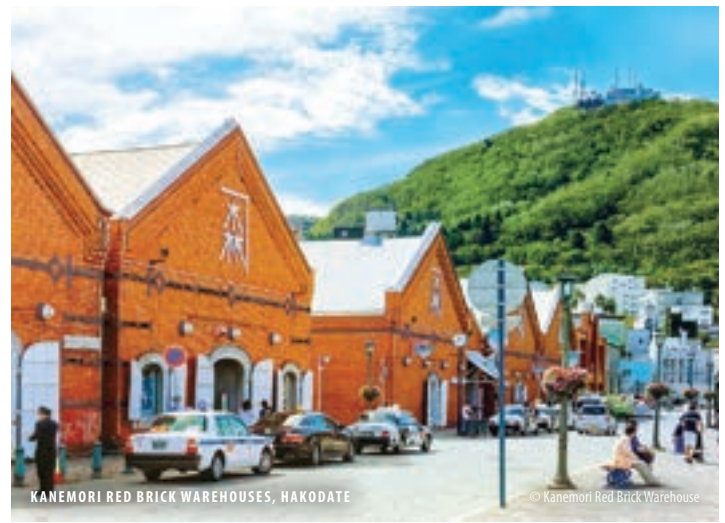
KANEMORI RED BRICK WAREHOUSES, HAKODATE

Day 4: Fri, Jun 25 – TOKYO. This morning, take in the view of the surrounding city from the observation deck of the Tokyo Skytree . At just over 2,000-ft-tall, it is the tallest tower in Tokyo. Rising 350m above the ground, the Tokyo Skytree Tembo Deck offers a 360° panoramic view of Tokyo. You'll also have time to enjoy lunch (on your own) at the restaurant located in Tokyo Skytree – or at TOKYO Solomachi, the large shopping, dining, and entertainment complex located at the base of the Tokyo Skytree. Asakusa's main attraction is Sensoji , a very popular Buddhist temple built in the 7 th century. The temple is approached via the Nakamise , a shopping street that has been providing temple visitors with a variety of traditional local snacks and tourist souvenirs