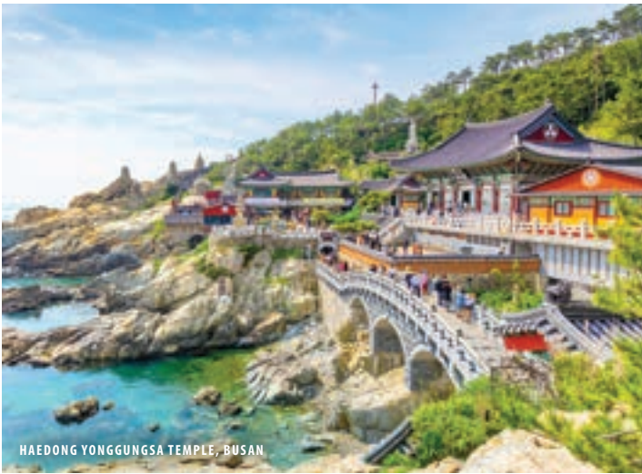
HAEDONG YONGGUNGSA TEMPLE, BUSAN

Day 14: Mon, Jul 05 – KAGOSHIMA, JAPAN. 7:00 am – 4:00 pm. (B, L, D)