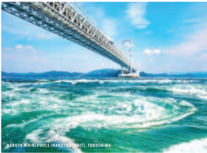
NARUTO WHIRLPOOLS (NARUTO STRAIT), TOKUSHIMA

Day 9: Sat, Aug 07 – AOMORI, JAPAN. 8:00 am – 11:00 pm. (B, L, D)