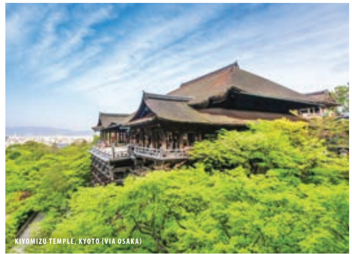
KIYOMIZU TEMPLE, KYOTO (VIA OSAKA)

Note: Tour itinerary is subject to change at any time with/without notice.