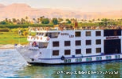
© Movenpick Hotels & Resorts / Accor SA