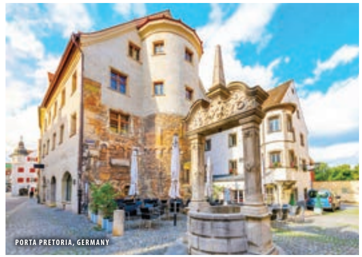
PORTA PRETORIA, GERMANY

Join a guided optional excursion to Schönbrunn Palace – summer home of the Habsburg Empire. Enjoy free time this afternoon to take a tram to visit Austria's Prater amusement park or one of the many museums nearby. You