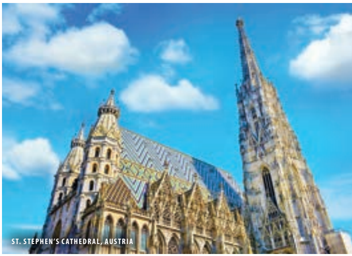
ST. STEPHEN'S CATHEDRAL, AUSTRIA

Select sightseeing is included in tour. Additional optional tours are available for purchase through Avalon Waterways. Itinerary shown is based on Avalon's 2027 tour. Tour itinerary and inclusions are subject to change at any time with or without notice by Avalon. In the event of technical or water level issues, it may be necessary to operate the itinerary by motorcoach or alter the program, including hotel overnight when necessary. Guided tours, optional excursions, activities, sailing, and docking schedules may be contingent on weather conditions or other issues outside of Avalon's control and therefore be subject to change at any time.