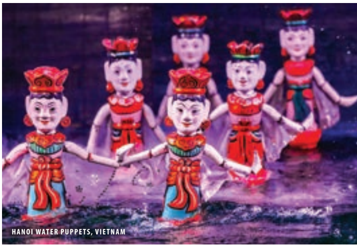
HANOI WATER PUPPETS, VIETNAM

Select sightseeing is included in tour. Additional optional tours are available for purchase through Avalon Waterways. Itinerary shown is based on Avalon's 2027 tour. Tour itinerary and inclusions are subject to change at any time with or without notice by Avalon. In the event of technical or water level issues, it may be necessary to operate the itinerary by motorcoach or alter the program, including hotel overnight when necessary. Guided tours, optional excursions, activities, sailing, and docking schedules may be contingent on weather conditions or other issues outside of Avalon's control and therefore be subject to change at any time.