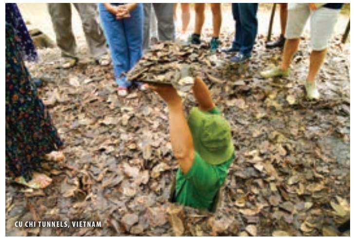
CU CHI TUNNELS, VIETNAM

CLASSIC EXCURSION: Take a walking tour of Ho Chi Minh City's historic landmarks, including a stop at the Rex Hotel for a refreshing drink at the rooftop bar where the