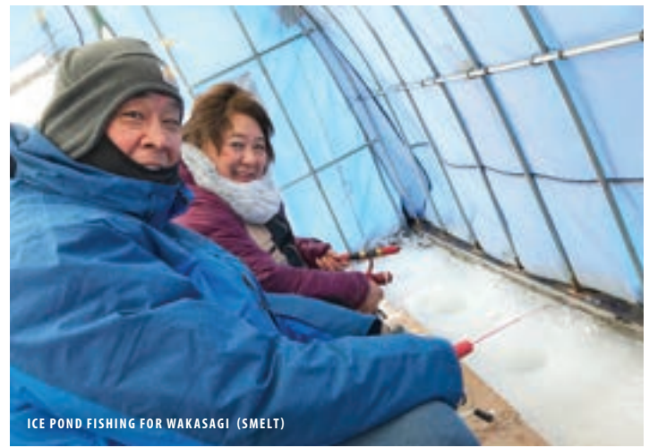
ICE POND FISHING FOR WAKASAGI (SMELT)

Day 6: Sun, Feb 07 – SAPPORO – ASAHIKAWA – SOUNKYO. After breakfast, depart Sapporo for Sounkyo. En route, stop at the Sunagawa Highway Oasis , a shopper's paradise. Take a tour of the