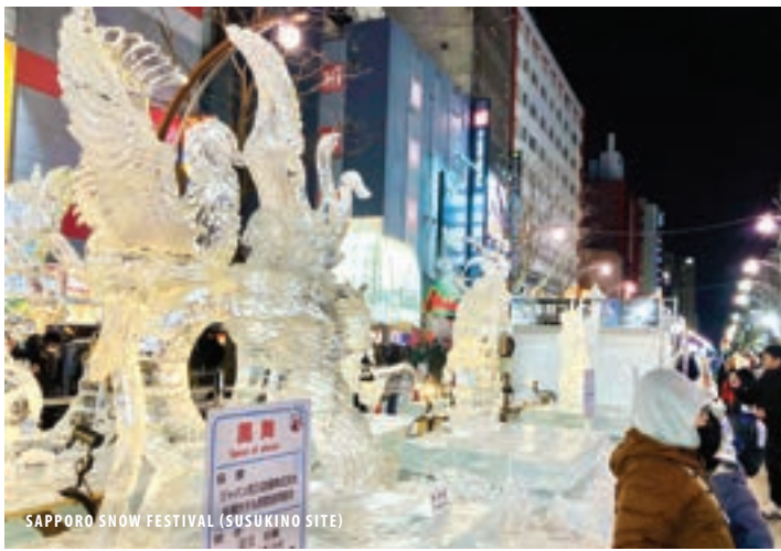
SAPPORO SNOW FESTIVAL (SUSUKINO SITE)

Day 1: Tue, Feb 02 – HONOLULU. Depart Honolulu via Japan Airlines flt #73 at 11:40 am.