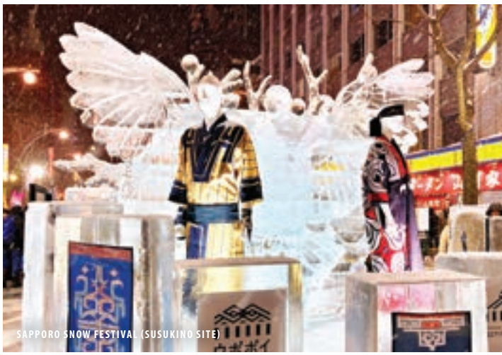
SAPPORO SNOW FESTIVAL (SUSUKINO SITE)

Day 1: Sat, Jan 30 – HONOLULU. Depart Honolulu via Japan Airlines flt #73 at 11:40 am.