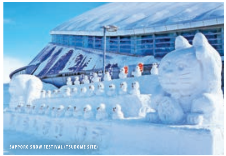
SAPPORO SNOW FESTIVAL (TSUDOME SITE)

Day 5: Wed, Feb 03 – SAPPORO – ISHIKARI – SAPPORO. After breakfast, begin the day with a tour of the new ROYCE' Cacao and Chocolate Town to learn how the famous ROYCE' chocolate treats are made. Receive a complimentary sample at the end of the tour. Stop at a local wholesale seafood market where an abundance of fresh seafood and the freshest local products can be found. While there, pick out "LIVE" crabs* from the tanks, to enjoy with a special kaisen don (fresh seafood over rice) lunch. After, take a drive-by sightseeing tour of Sapporo – including the TV Tower, Clock Tower, and the Former Government Office Building . This afternoon, you'll have the chance to experience two of the three main sites of the SAPPORO SNOW FESTIVAL : Odori and Susukino. Started in 1950, when high school students built a few snow statues, the Sapporo Snow Festival has since developed into a world-class event attracting more than two million visitors. The Odori site is the festival's main venue and was the original site of the first glacial gathering. This site stretches across Odori Park, with each of the 11 street blocks housing various interactive points or sights. The main highlights include snow sculptures from local artisans and Sapporo citizens, snowboard experience activities, and an impressive projection mapping show.