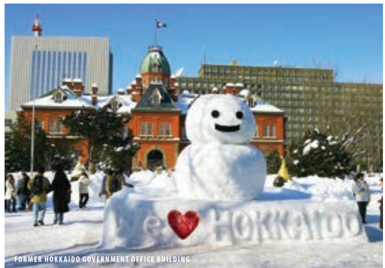
FORMER HOKKAIDO GOVERNMENT OFFICE BUILDING