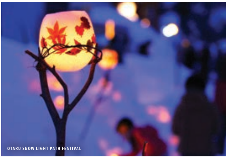
OTARU SNOW LIGHT PATH FESTIVAL

walk along a 500 meter snow covered walkway, a way for the zoo to keep the birds fit during the winter months. While the penguins have a tendency to keep together as a group during these walks, sometimes some wander off course towards the crowd of visitors, and need to be “reminded” where they are going. Have your camera ready as these birds waddle past you on their daily walk. Next, experience one of the most popular winter festivals in Hokkaido, the ASAHIKAWA WINTER FESTIVAL . As Hokkaido’s second largest winter festival, after Sapporo’s snow festival, Asahikawa Winter Festival boasts one of the biggest snow sculptures. Each year, one massive sculpture is made as a stage for music or other performances. The giant sculpture has a different theme each year. What will the theme be this year? Will it top the giant sculpture built in 1994 which made it into the book of Guinness World Records as the largest snow construction ever built? Warm up over dinner at a local restaurant, before arriving at the hotel for the evening. Don’t forget to warm up in the hotel’s public bath . JR INN ASAHIKAWA (1 Night) (B, D)