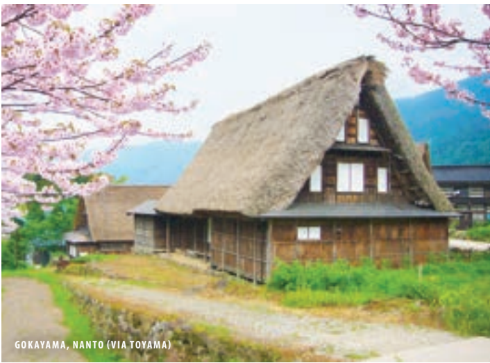
GOKUYAMA, NANTO (VIA TOYAMA)

Day 10: Sun, Apr 11 – NAGASAKI, JAPAN. 8:00 am – 5:00 pm. (B, L, D)