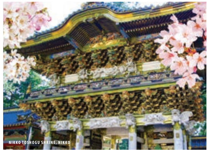
NIKKO TOSHOGU SHRINE, NIKKO

Note: Tour itinerary is subject to change at any time with/without notice.