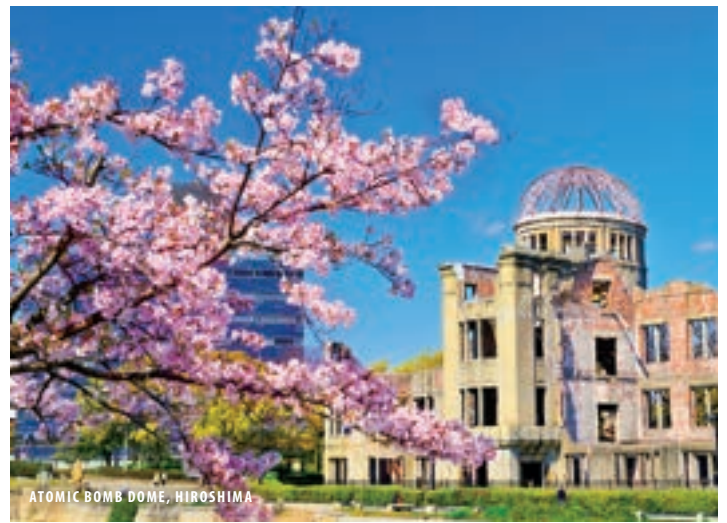
ATOMIC BOMB DOME, HIROSHIMA

Note: Tour itinerary is subject to change at any time with/without notice.