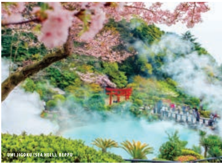
UMI JIGOKU (SEA HELL), BEPPU

Day 14: Thur, Mar 25 – KANMON STRAITS (SCENIC CRUISING). 12:30 pm – 2:30 pm. (B, L, D)