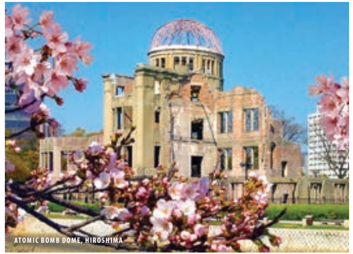
ATOMIC BOMB DOME, HIROSHIMA

Note: Tour itinerary is subject to change at any time with/without notice.