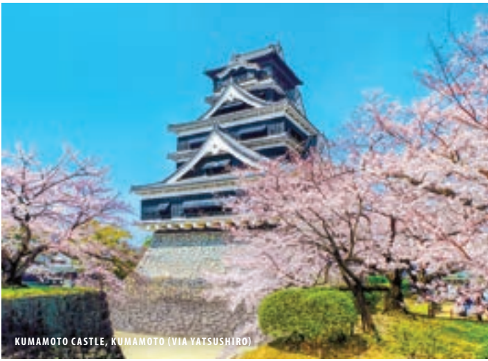
KUMAMOTO CASTLE, KUMAMOTO (VIA YATSUSHIRO)

Day 14: Tue, Apr 06 – HIROSHIMA, JAPAN. 7:00 am – 5:00 pm. (B, L, D)