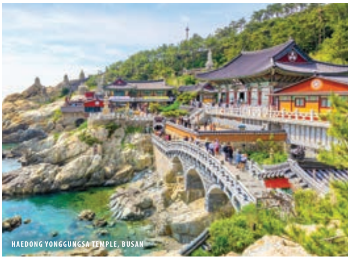
HAEDONG YONGGUNSA TEMPLE, BUSAN

Day 14: Sun, Mar 14 – MIYAZAKI (ABURATSU), JAPAN. 7:00 am – 4:00 pm. (B, L, D)