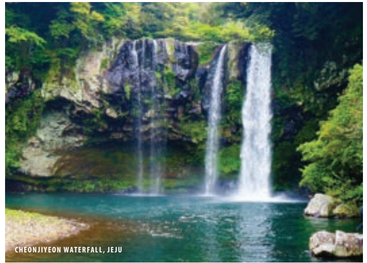
CHEONJIYEON WATERFALL, JEJU

Note: Tour itinerary is subject to change at any time with/without notice.