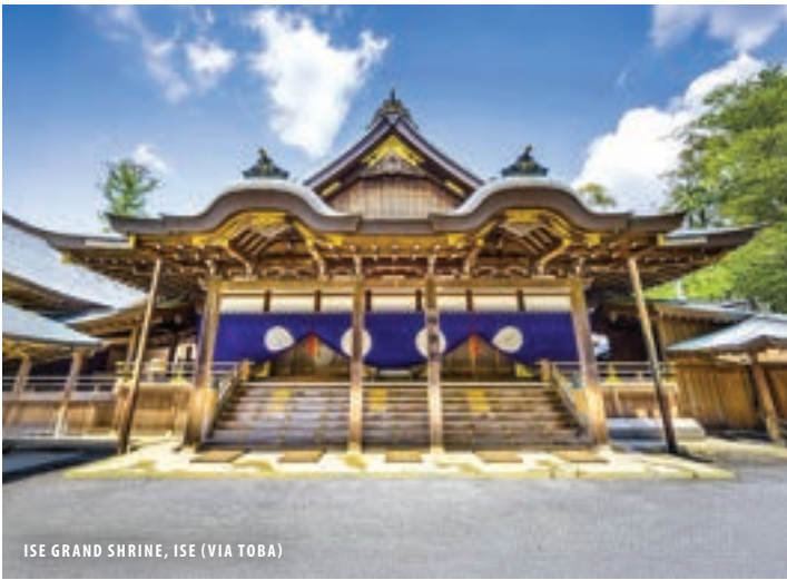
ISE GRAND SHRINE, ISE (VIA TOBA)