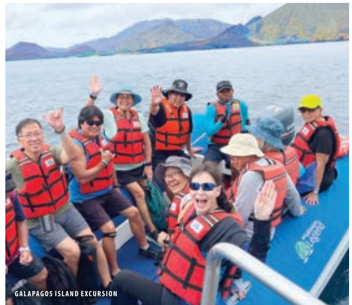
GALAPAGOS ISLAND EXCURSION

Day 15: Mon – QUITO – BALTRA – SANTA CRUZ ISLAND – EMBARK GALAPAGOS LEGEND – GALAPAGOS CRUISING. Fly to Baltra and visit the highlands of Santa Cruz , marked by extinct