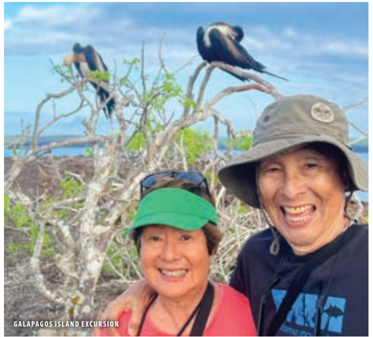
GALAPAGOS ISLAND EXCURSION