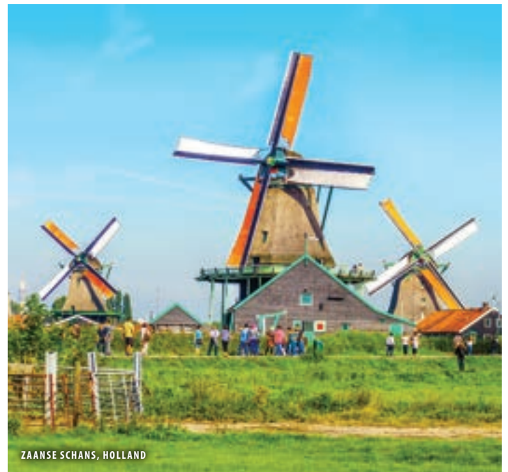
ZANSE SCHANS, HOLLAND

📷 CLASSIC EXCURSION: Discover the true beauty of Amsterdam with an off-the-