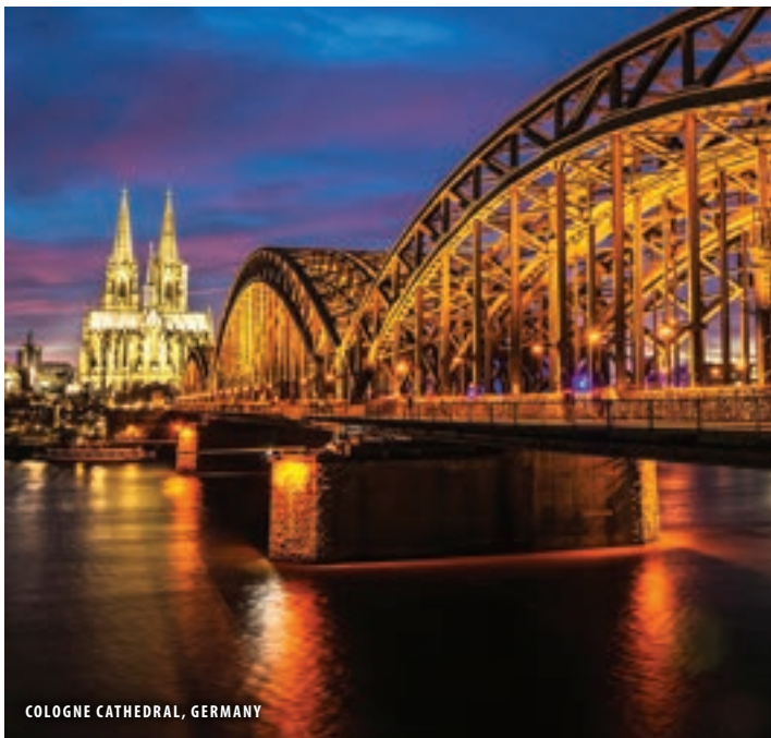
COLOGNE CATHEDRAL, GERMANY

📷 CLASSIC EXCURSION: Enjoy a guided tour to Heidelberg Castle to see the ruins of the magnificent renaissance treasure towering above the city, and its famed Great Vat, the “World’s Largest Wine Barrel,” OR