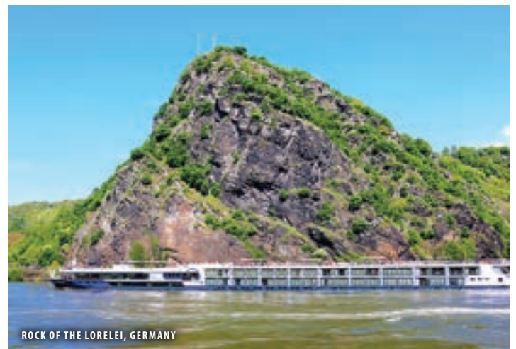
ROCK OF THE LORELEI, GERMANY

Don't miss out on your chance to join a scenic river cruise on the Rhine River! Call today!!