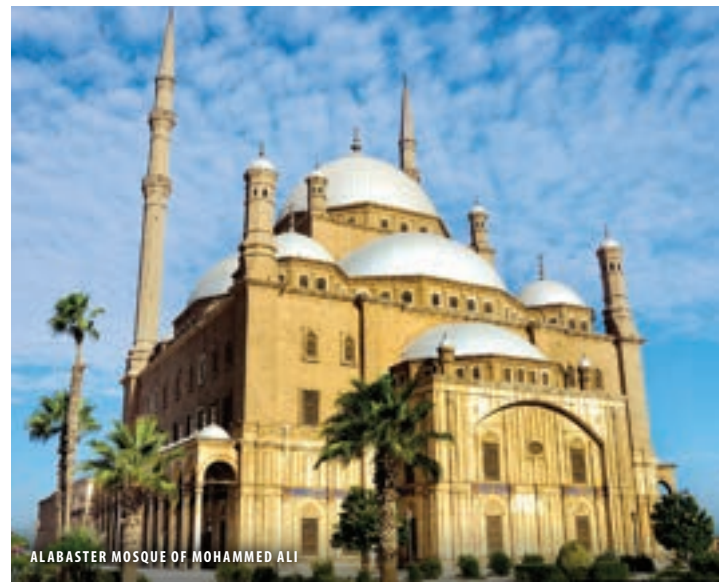
ALABASTER MOSQUE OF MOHAMMED ALI

Day 5: Sat, Feb 06 – CAIRO – MEMPHIS – SAKKARA – CAIRO.