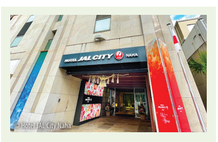
HOTEL JAL CITY NAHA – 4-STAR (4 NIGHTS): The hotel is conveniently located facing Naha's Kokusaidori, the center of tourism.