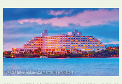
ANA INTERCONTINENTAL MANZA BEACH RESORT – 4-STAR (1 NIGHT): Surrounded by a coral reef and pristine National Park, the hotel is a luxury beach resort off the coast of Okinawa Island.