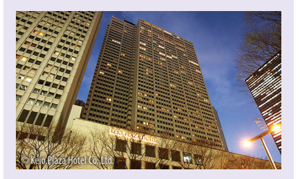
KEIO PLAZA HOTEL TOKYO – 4-star (5 Nights) "Luxury in the heart of Tokyo." The hotel is at the perfect location to explore the delights of the city of Tokyo. Just outside Tochomae Station or only a five minute walk from Shinjuku Station, with some of the most popular shopping and entertainment spots.